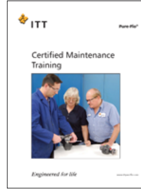
Certified Maintenance Training PFCM-08 (under development - contact local ITT representative)