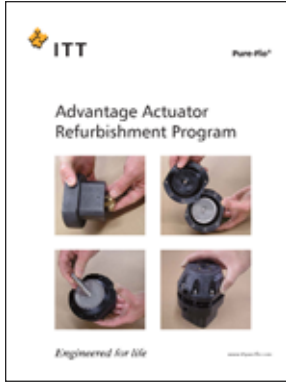
Advantage Actuator Refurbishment Program PFARP-08

For more information check out the literature below, found at www.ittpureflo.com .