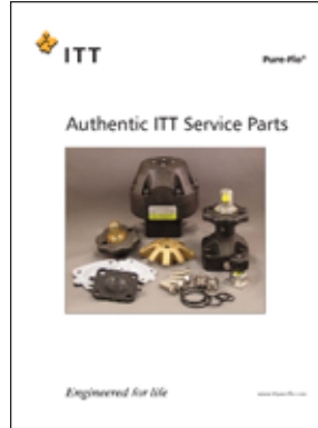
Authentic ITT Service Parts PFSP-08